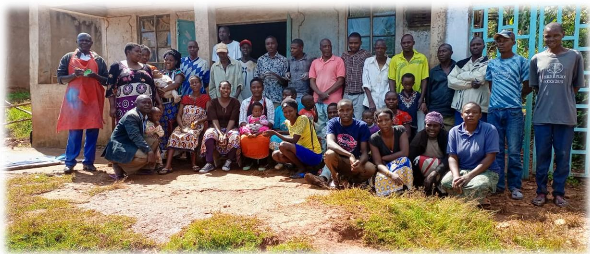
Members of the Tabaka Chigware Youth Self-Help Group

Soapstone is a soft rock that largely contains talc and while it is easy to carve, it is also durable and heat resistant. Using hand tools, blocks of soapstone are dug out of large pits, before being cut into smaller pieces for transportation to the workshops. The carving is done by skilled and experienced carvers, with younger carvers often observing and practising their skills to refine their expertise. The stone is then sanded and washed several times, until the surface is completely smooth, before being painted and polished with a creamy wax.