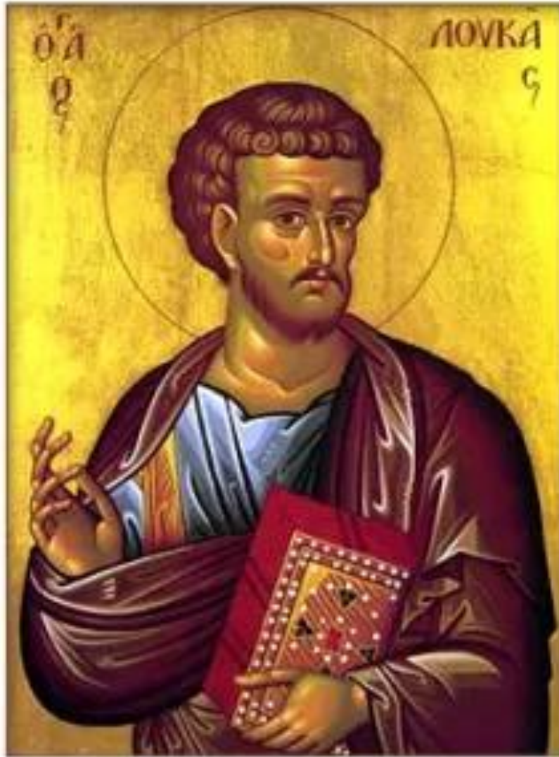
St Luke the Evangelist